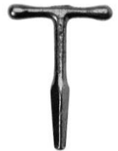
GD2-G24597 (125 mm T-key)