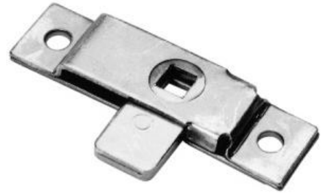
GD2-G09656 (Budget latch with steel bolt)