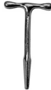
GD2-G24596 (90 mm T-key)